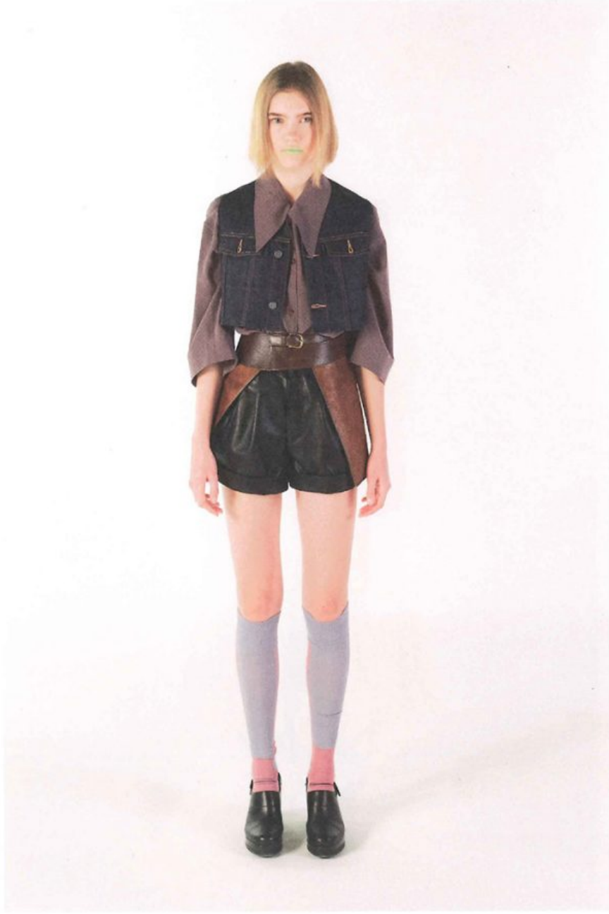
SLEEVELESS JACKET BY A.P.C. , SHIRT BY LEMAIRE , SHORTS BY SAINT LAURENT BY ANTHONY VACCARELLO , BELT BY ANNE MARIE BERETTA FROM PASSAGE PARIS , SOCKS BY MIU MIU AND SHOES BY CAMPER STYLIST'S OWN.